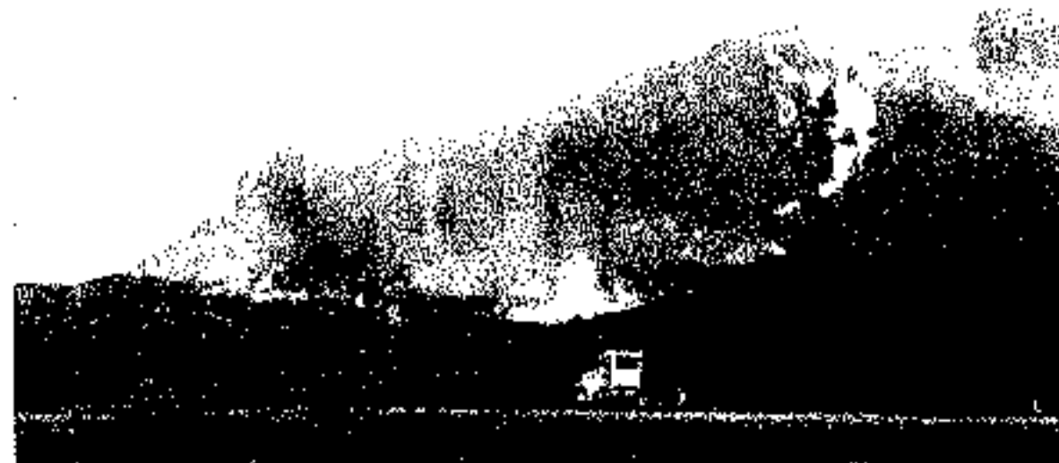
Ranch Creek Fire, April 2007

The western portion of Grand County also has reception of NOAA Weather Radio (All-Hazards) on 162.525MHz, SAME code 008049.